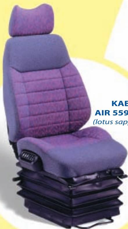
KAB AIR 559ACS (lotus sapphire)