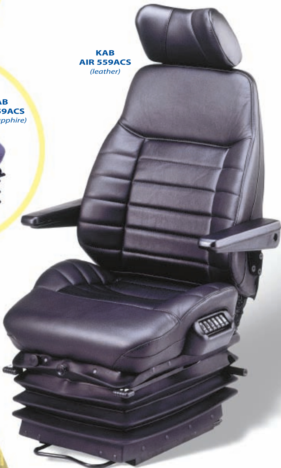
KAB AIR 559ACS (leather)