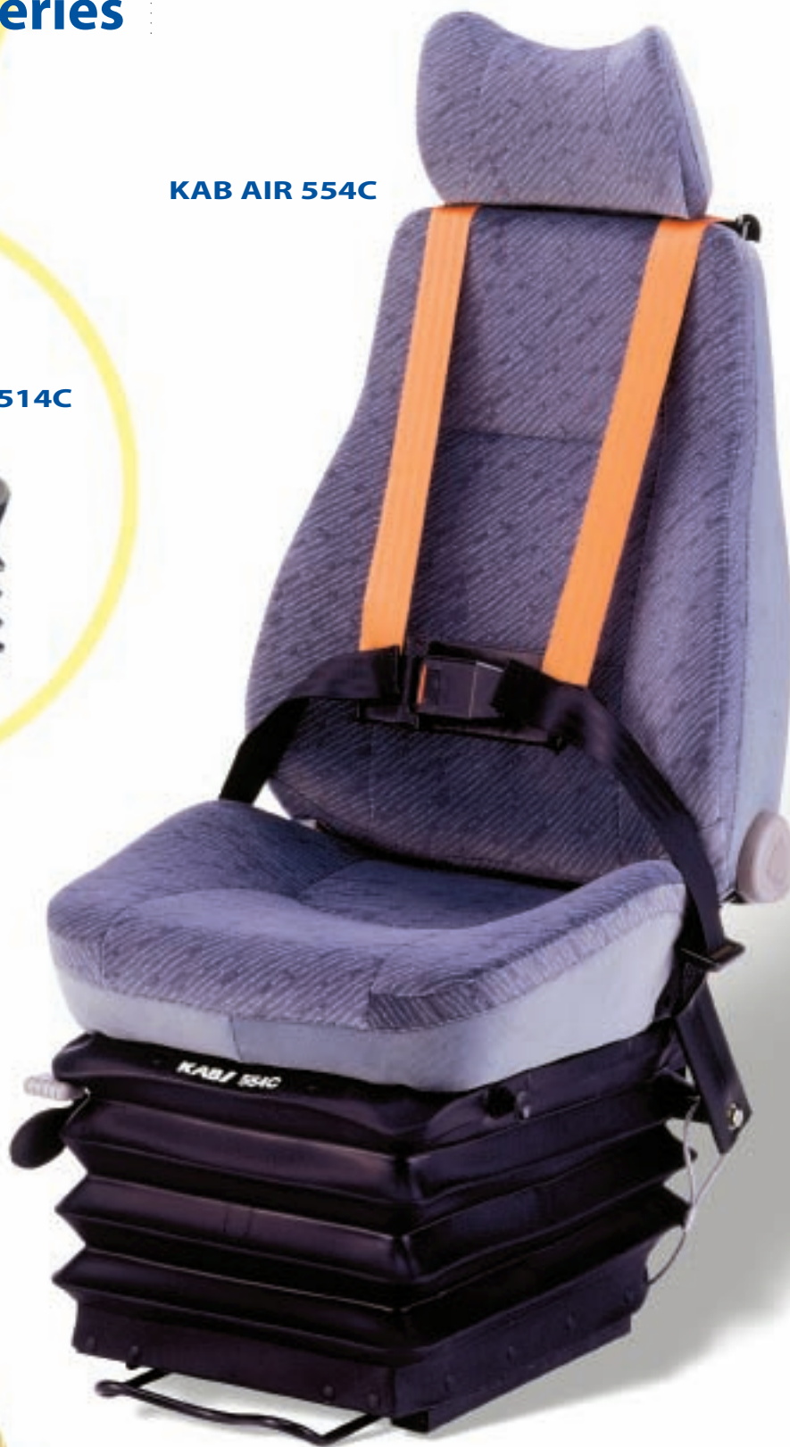
KAB AIR 554C