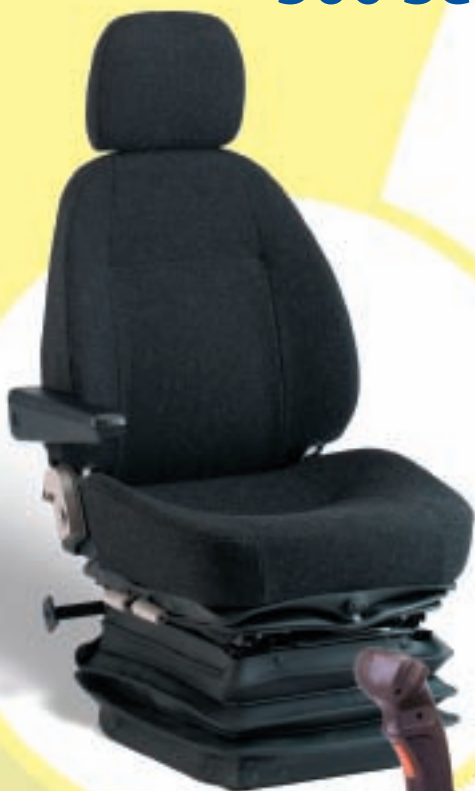
KAB AIR 555P (To take customer pods)