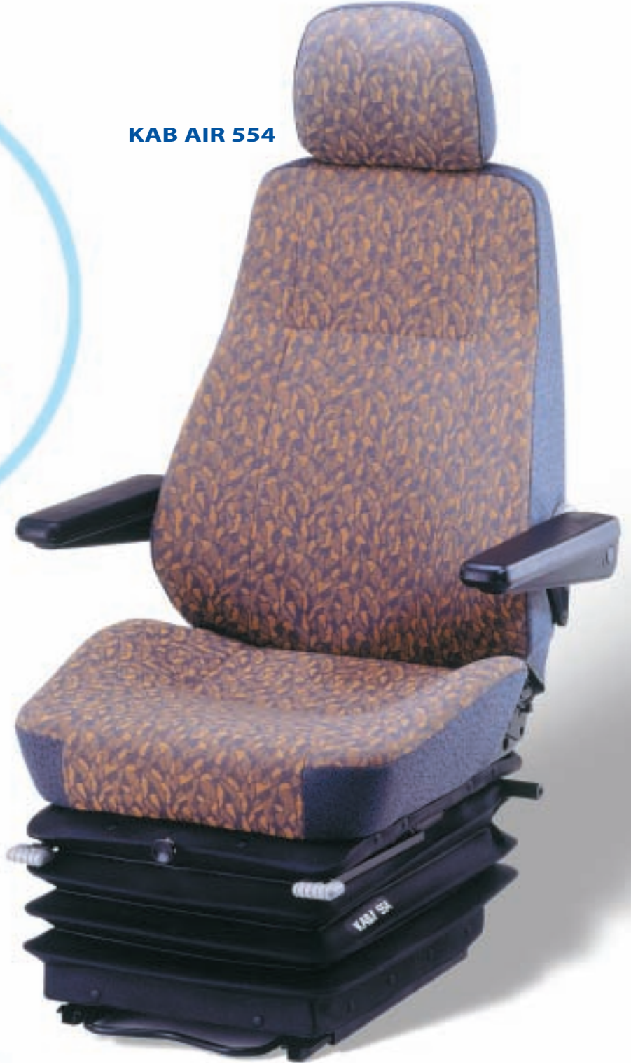
KAB AIR 554