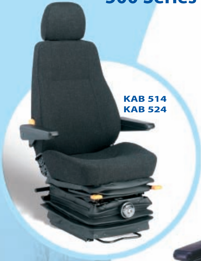
KAB 514 KAB 524