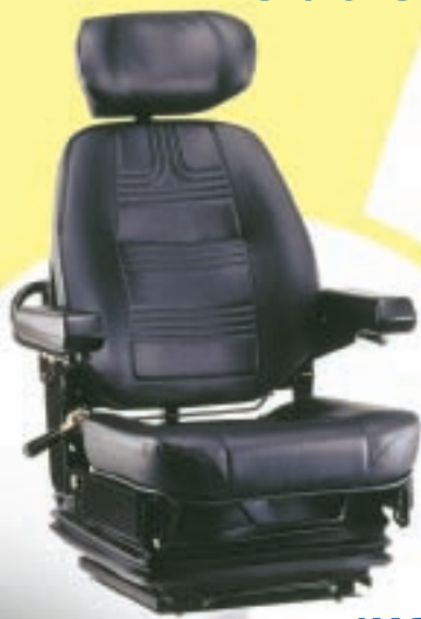
KAB 301K MARINE