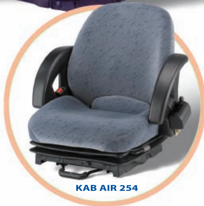
KAB AIR 254